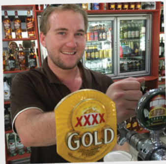
Stop in for a beer at the Award Winning Goldfields Hotel