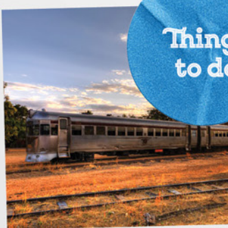
Experience the Savannahlander train