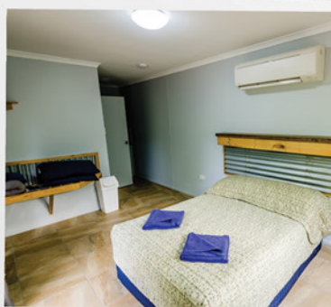
Enjoy comfortable accommodation