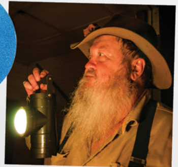
Prepare for a night of mystery on the Forsayth By Night Lantern Tour!